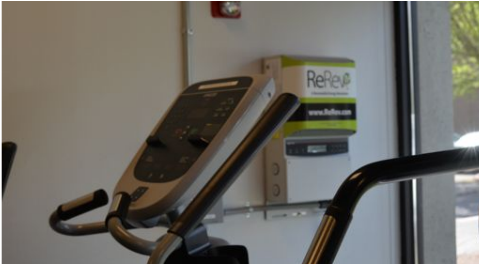
Student electricity generating initiative