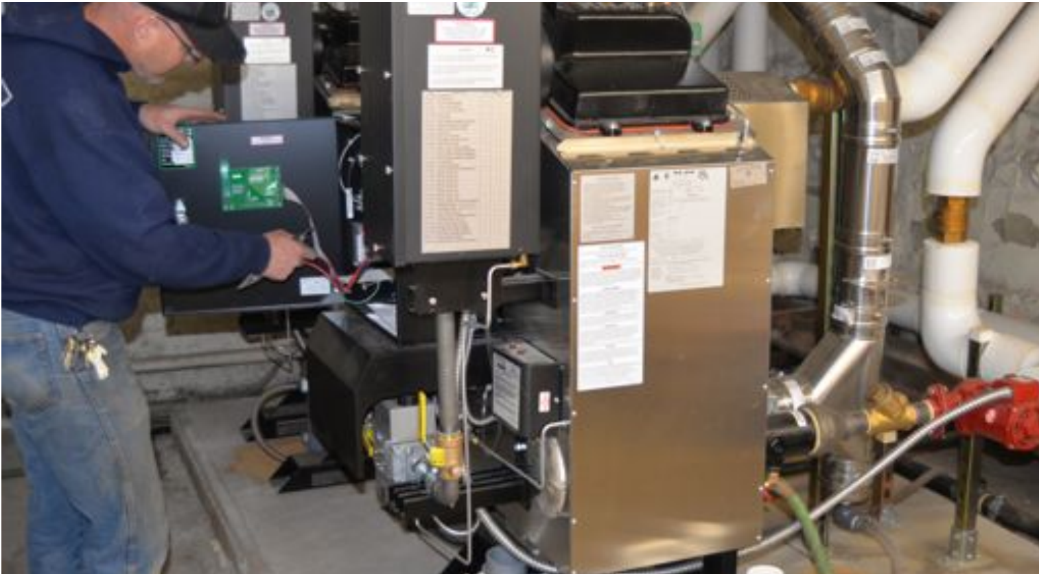
Dave Cookman/Marsh Hall 97%-efficient condensing gas boilers