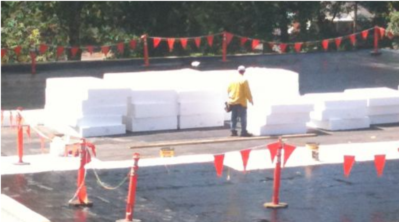
Scott Hall polystyrene roof insulation, July 2012