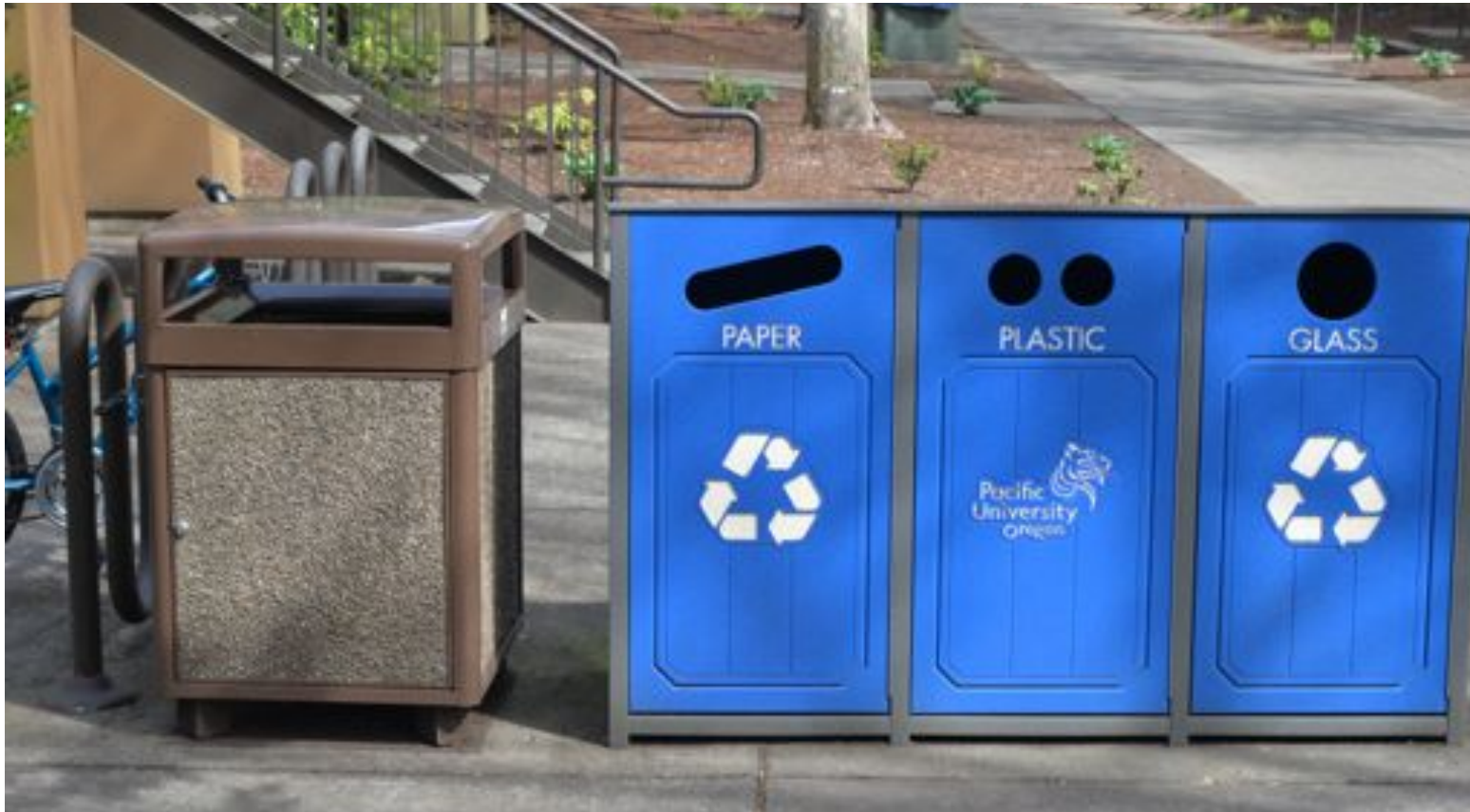
Better set up