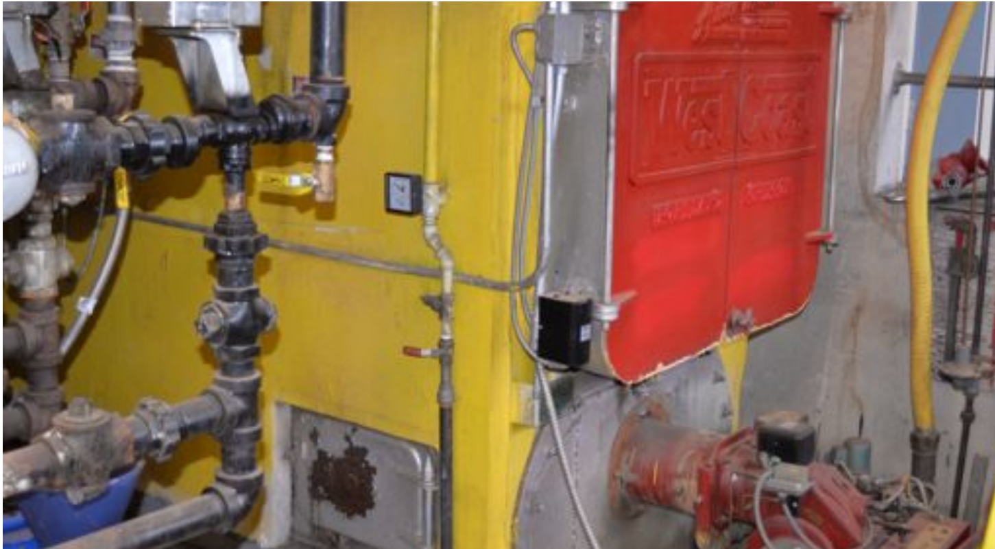
Walter Hall, old oil boiler converted to natural gas