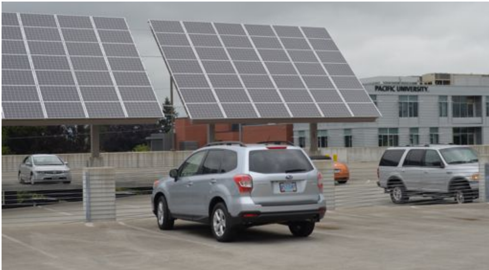
Hillsboro Intermodal Transit Facility with photovoltaic panels on the roof, Creighton Hall in the background