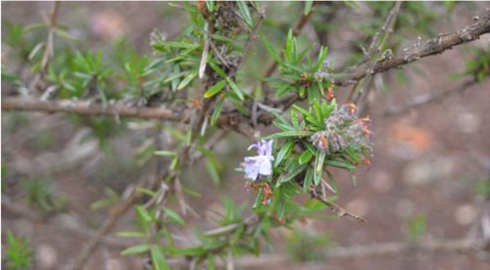
Rosemary, native to the Mediterranean and Asia