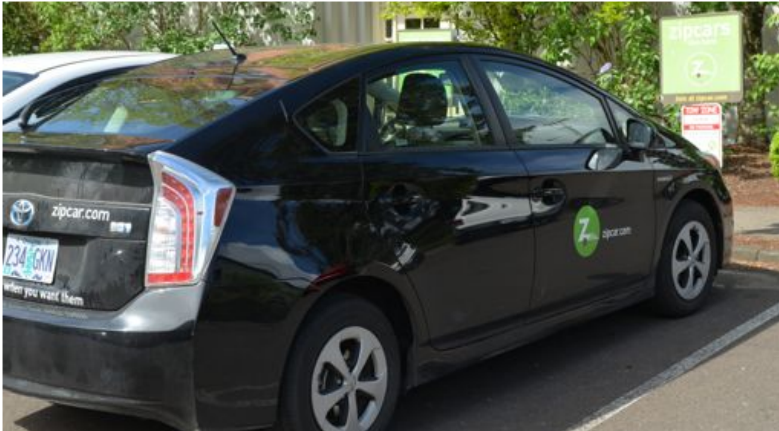
Two Zipcars on the Forest Grove campus, one a 50 mpg Prius