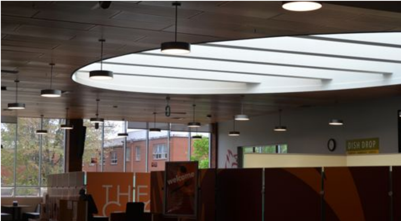
University Center daylighting and LED light fixtures