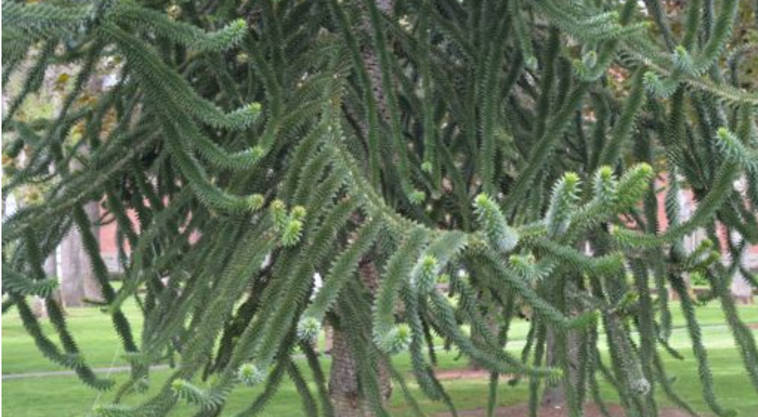
Monkey puzzle tree, native to the Andes