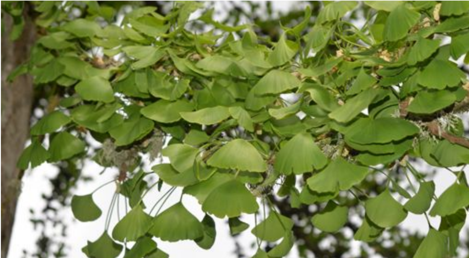
Ginkgo biloba, native to China